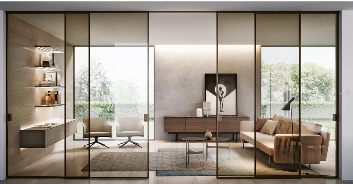
Plana System with recessed tracks, Crystal BI sliding divider doors, CRYSTAL BI SLIDING Brown finish aluminum frame, Traspresente Bronzo glass, recessed Link handle.