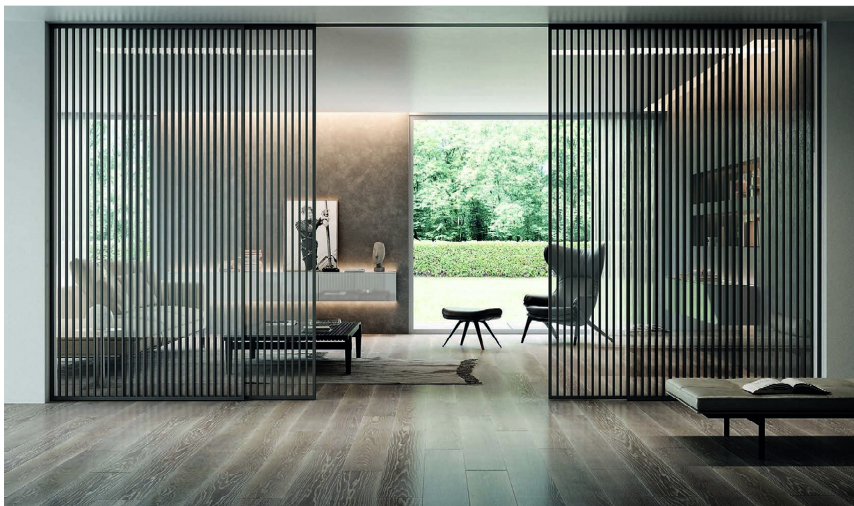
KANSAS A bold aluminium structure available in the finishes Antracite, Brown, Bianco and Argento. The dense vertical / horizontal strips texture creates a "frame" with an effect of a solid but light wall.